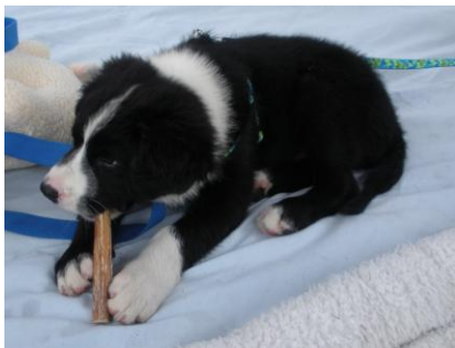
Panda Bear—adopted in July 2011

We work very hard to match the needs of the dog with those of the adoptive family to be sure we have a great fit for both.