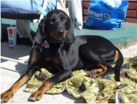
Trooper—adopted in July 2011

There are many advantages to adopting your pet from Paws Place. All our dogs are spayed or neutered. They are up-to-date on their vaccinations, and have had all health issues addressed before they are ready for adoption. These dogs spend a lot of time with our workers and volunteers, and we know their personalities, traits, likes and dislikes well.