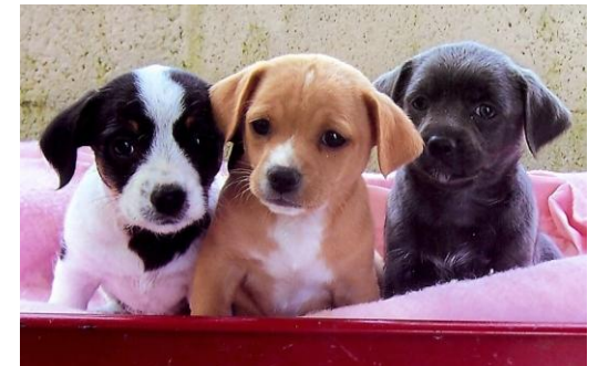
Carolina's puppies—all were adopted

Phone: 910-845-PAWS www.pawsplace.org www.facebook.com/pawsplace